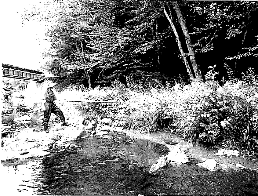
Figure 3 Close up of Figure 2. Survey rod shows slope (nearly flat) of the lateral bar surface.