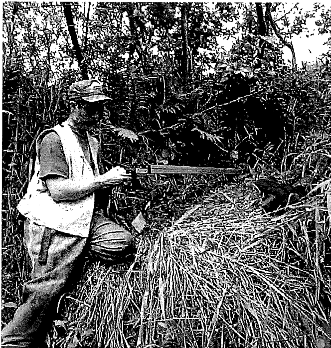
Figure 4 Lateral bar indicating bankfull stage. Note that the upslope flag is location of bankfull stage. At this location the slope of the bar surface becomes nearly flat. Also note the woody vegetation line at that point.