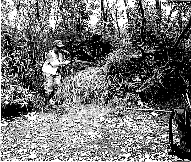
Figure 5 Removed view of Figure 4. Note that the most significant break in slope is disregarded for the location on the bank where the slope becomes flat and a change in vegetation occurs.