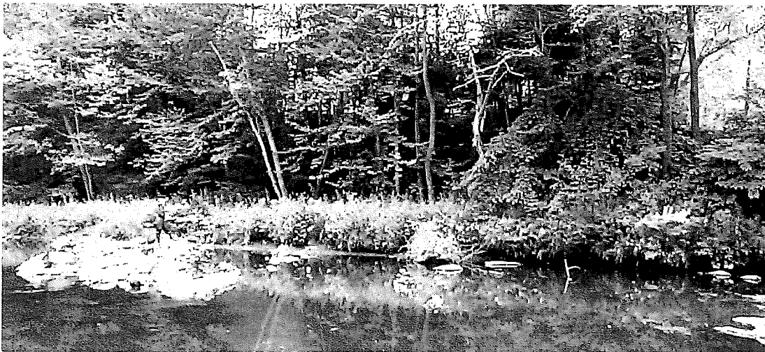
Figure 2 Well developed lateral bar indicating bankfull stage.