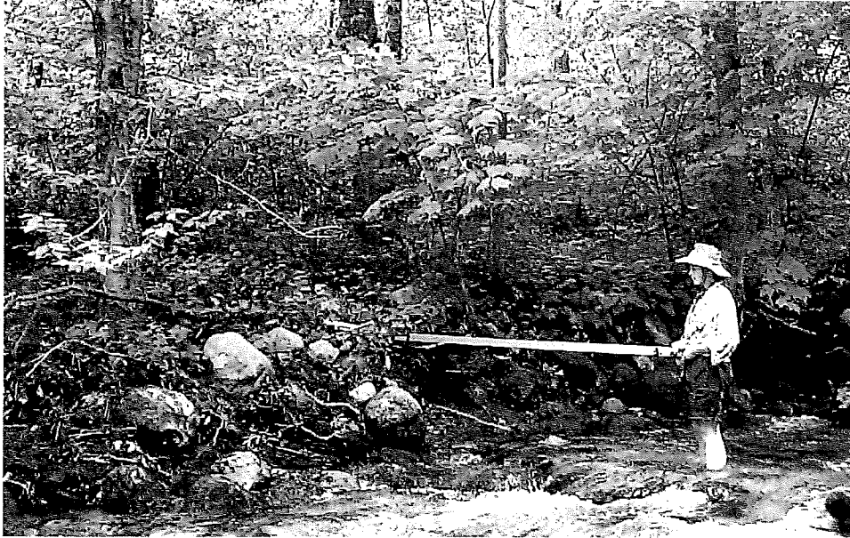
Figure 7 Example of a well developed floodplain in a system characterized by boulder size boundary material.