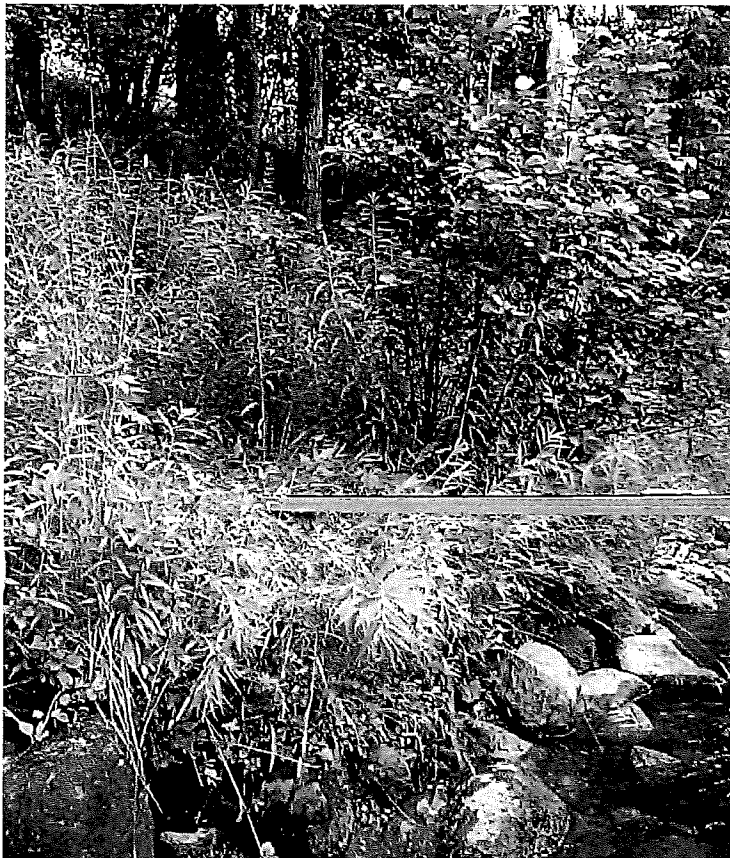
Figure 6 Bench feature indicating bankfull. Survey rod shows the slope of the bench surface.