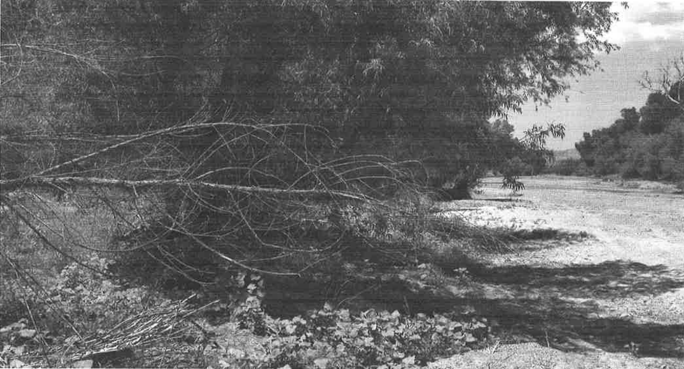
Figure 21.5 Photographs of the Santa Cruz River near Nogales, Arizona.

A. (November 24, 1930.) This downstream view, one of three photographs taken in the early 1930s showing this general perspective, shows the stilling well and cableway at the gaging station on the Santa Cruz River near Nogales. Frémont cottonwood and black willow appear along the river in the distance. The vegetation on the hillside behind the cableway tower consists of mesquite and catclaw.